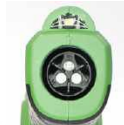
Nozzle #2 (Clean)