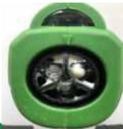
Nozzle #1 (Dirty)

Example below: Nozzle #1 (Dirty) & Nozzle #2 (Clean). Nozzle #1 has not been properly cleaned after being used. When not properly cleaned, residual chemical deposits build up on the sprayer nozzle. Deposit build-up results in decreased bar pressure and decreased spray patterns. The recommendation is that a full tank of water is sprayed through the unit after every few days of use to rinse any residual chemical build-up to reduce the chance of blockage.